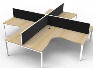
Natural Oak Top White Satin Frame