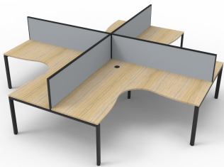
Natural Oak Top Black Satin Frame